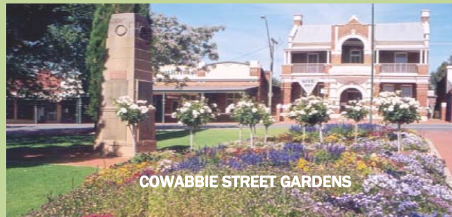
COWABBIE STREET GARDENS

Coolamon's accommodation and eateries exude the warmth & relaxation of country hospitality.