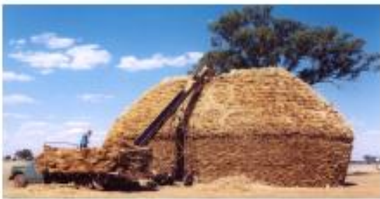
The rare trades of stooking & stack building are still practiced in & around Ganmain in order to produce Australia's premium quality chaff.