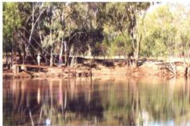
Historic Railway Dams provide the perfect backdrop for the Murumbung Interpretive Walk of Indigenous Flora & Fauna