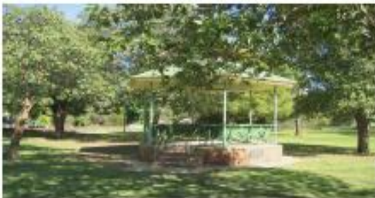
With modern BBQ facilities, playground, picnic area & rest rooms, the beautiful Victory Gardens are a popular rest stop for travellers.