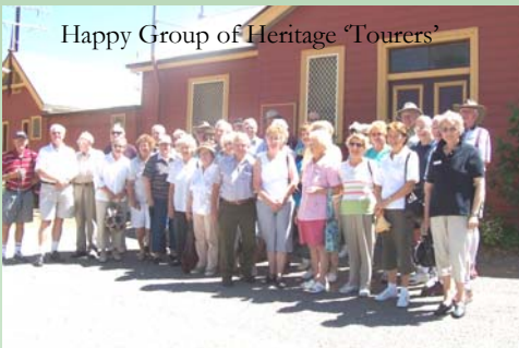
Happy Group of Heritage 'Tourers'